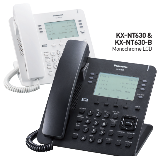
KX-NT630 & KX-NT630-B Monochrome LCD