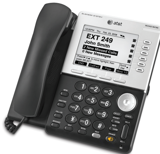
SB67031 Feature Deskset

Questions? Contact your account manager or the Partner Support Desk at (888) 916-2007.