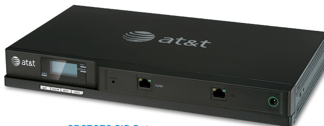
SB67070 SIP Gateway