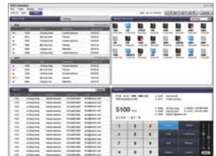
User Interface for iPECS-CM