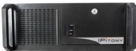
IP2000 - Pure IP PBX

Go to IPitomy.com for more details and a complete list of features.