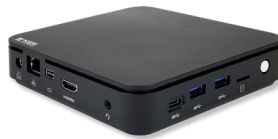
Borealis Hub V1