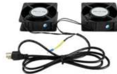
WME-FAN Dual Fan Kit for 27U/42U Cabinets