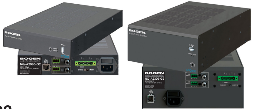
Models NQ-A2060-G2 & NQ-A2300-G2 shown