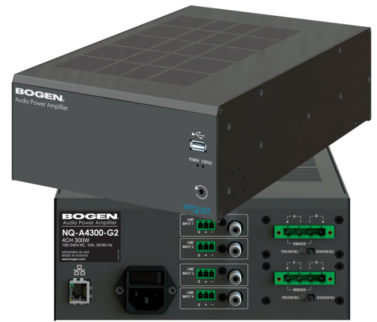
Model NQ-A4300-G2 shown