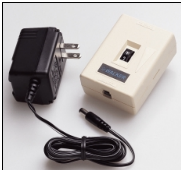
Amplifier shown: W10

The W10 series boost the receiver volume over three times the normal level, making hard-to-hear calls easier to hear.